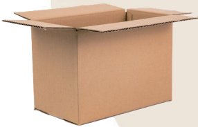
← 货物长途运输 Long-distance transportation